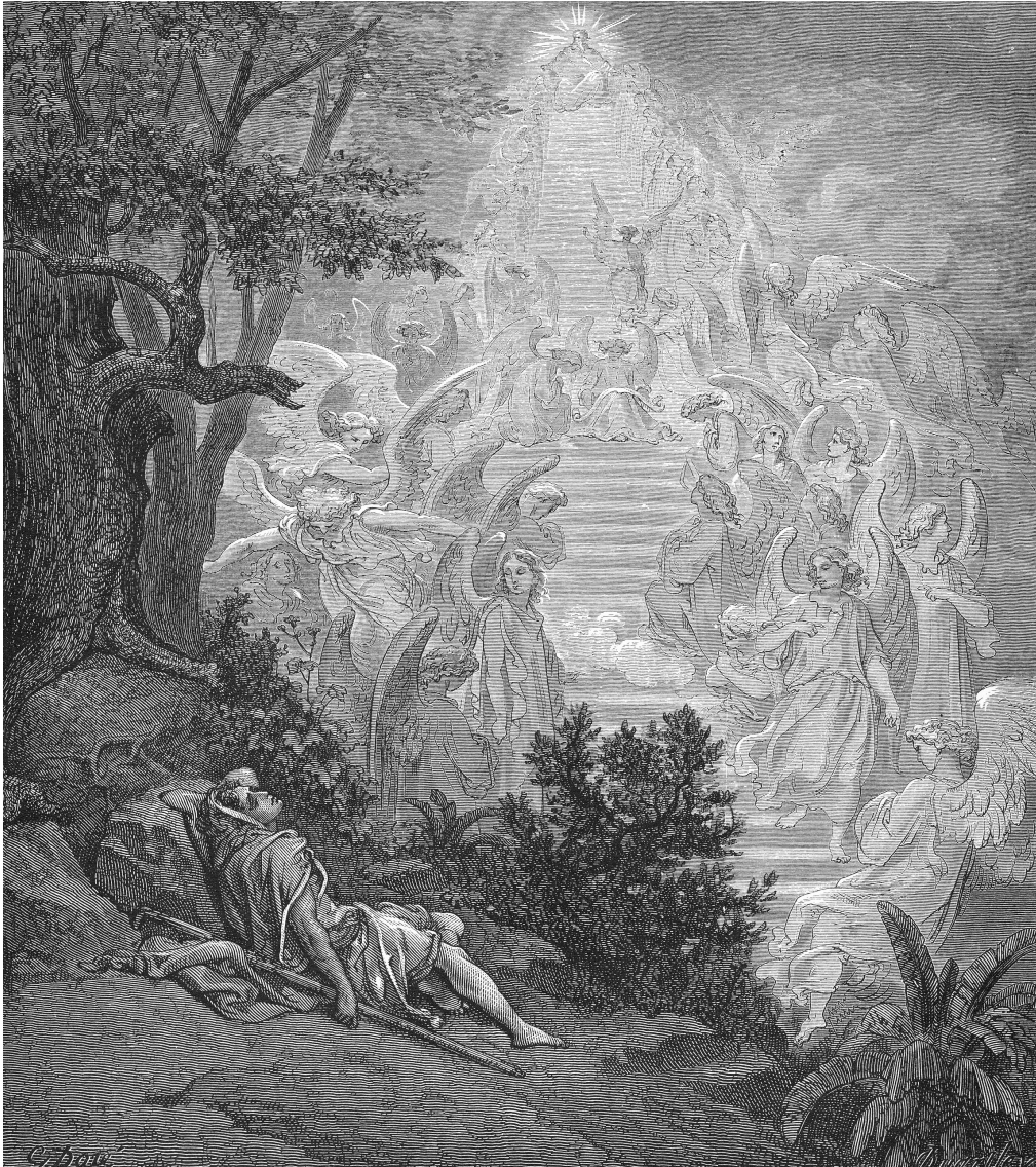
from: The Doré Bible illustrations by Gustave Doré