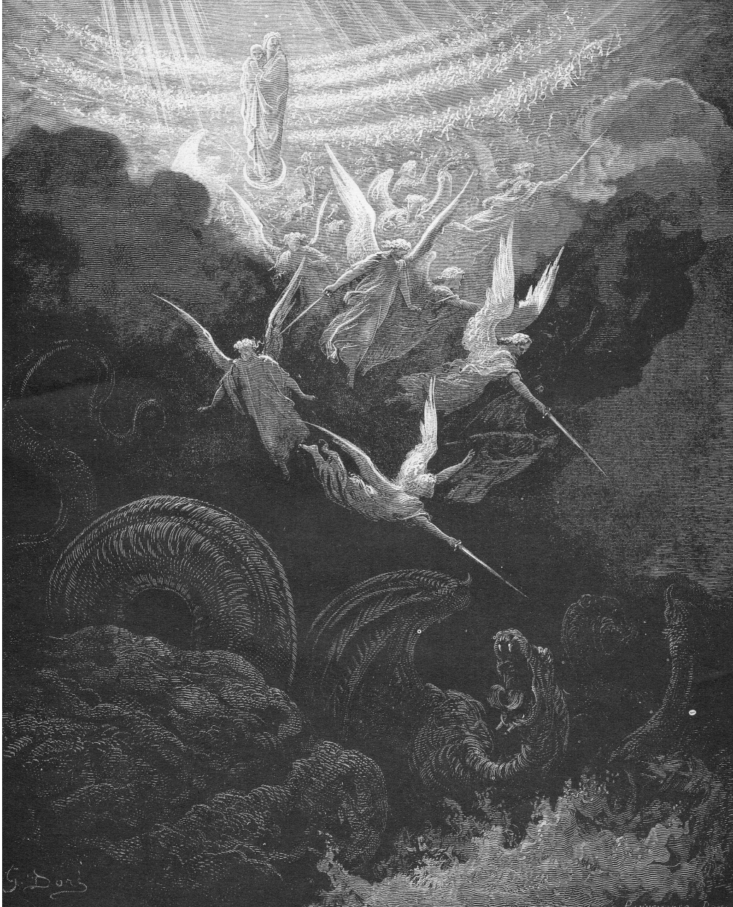
from The Doré Bible illustrations by Gustave Doré