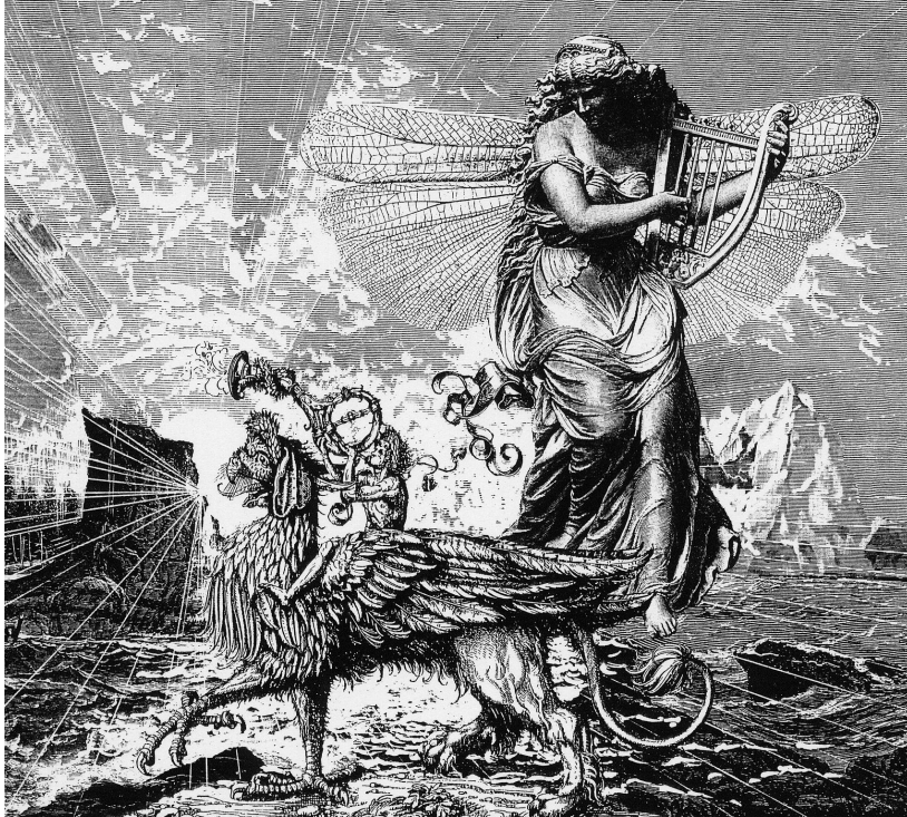
Collage from Don Beaman and other artists